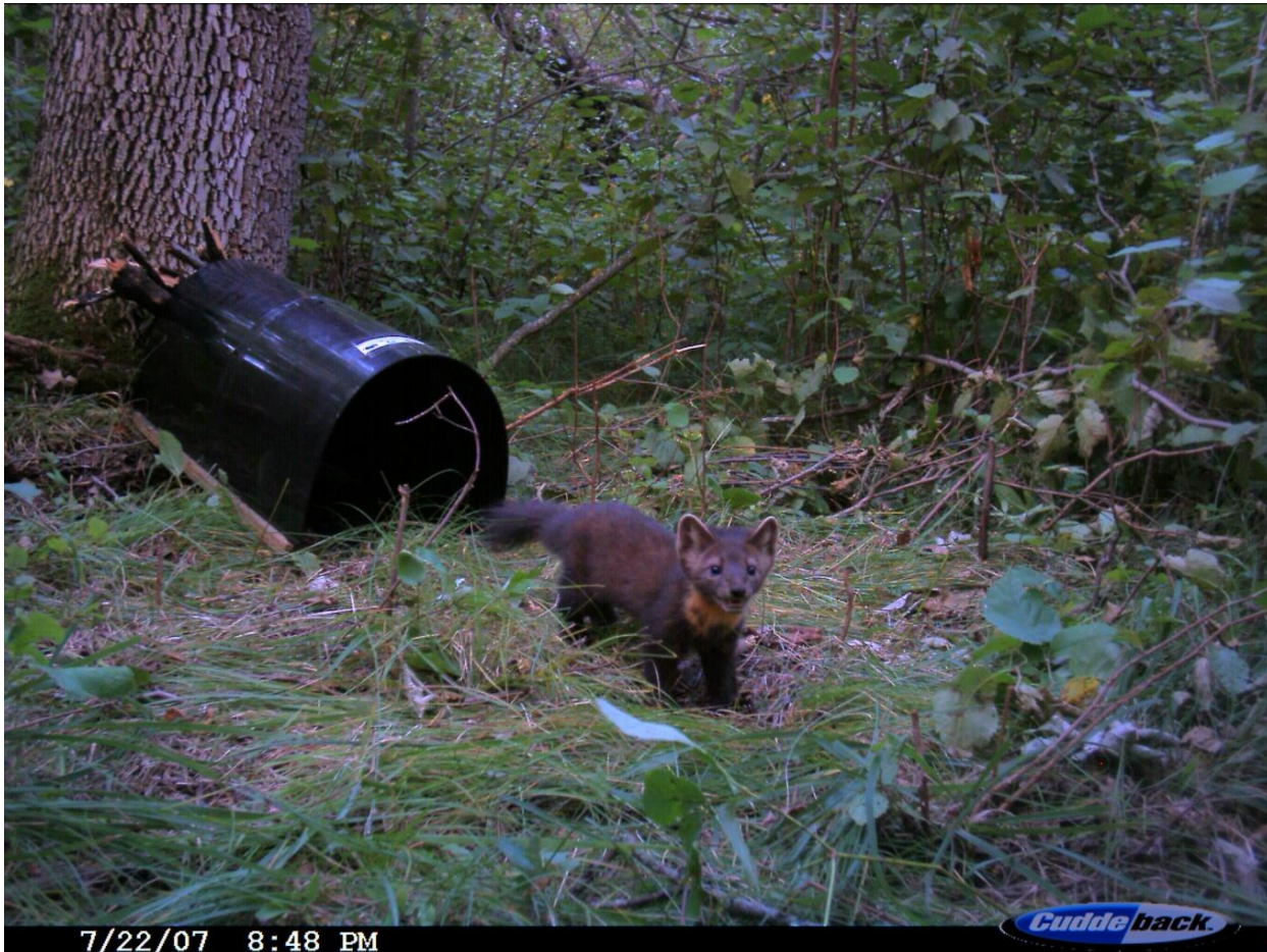
Figure 3. Photograph taken with a remotely-triggered camera of an American marten leaving a covered track-plate in the Turtle Mountains of North Dakota, USA, summer 2007.

nearest potentially suitable, contiguous forested habitat associated with marten's historic distribution in North Dakota (e.g., the Pembina Hills; Bailey 1926). The plains (now largely converted to agriculture; Bryce et al. 1998) separating the Turtle Mountains from forested habitat further east in North Dakota is devoid of substantive forest cover, a condition that predominated prior to European settlement in the region (Bluemle 2002). Based on current understanding of marten habitat requirements (e.g., Thompson 1994, Hargis et al. 1999, Poole et al. 2004, Porter et al. 2005, Proulx 2006), the paucity of forest cover in the area separating the Turtle Mountains from the Pembina Hills would presumably be unsuitable to readily support eastward expansion of the population in the Turtle Mountains. However, fishers ( M. pennanti ) have been re-populating forested areas in eastern North Dakota, apparently by range expansion from Minnesota (Triska 2010, Triska et al. 2011).