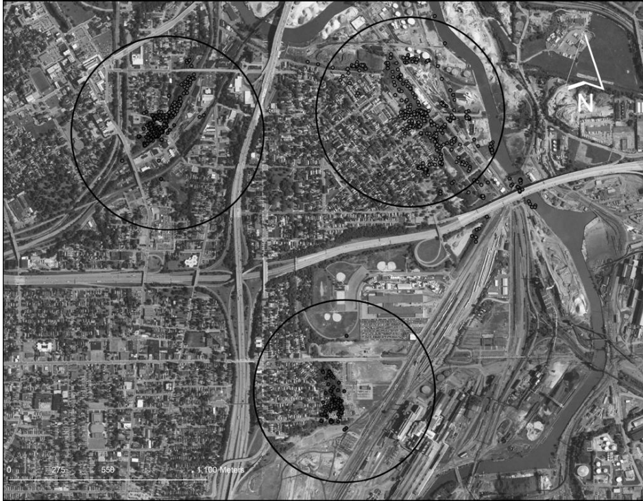
Figure 1. Representative urban study sites (with raccoon [ Procyon lotor ] locations), Cleveland, Ohio, USA, May 2009 to March 2010.