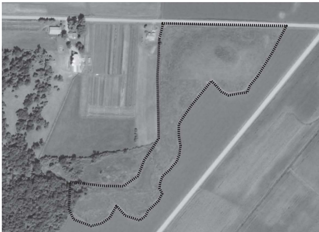
Figure 1. Air photograph of Black Earth Rettenmund Prairie State Natural Area taken in 2008, showing the surrounding area. The road on the north is Fesenfeld Road, and that on the east is Dane County Highway F. The site is about 0.6 km west of the Village of Black Earth in Dane County, Wisconsin. Except for a small woody area, the prairie is now surrounded entirely by plowed fields or pastures; total area is 6 ha.

robolus heterolepis ), side oats grama ( Bouteloua curtipendula ), and needle grass ( Stipa spartea ). In addition, there are over 150 species of forbs. Showy forbs that are often responsible for spring and summer displays include butterfly milkweed ( Asclepias tuberosa ), lead plant ( Amorpha canescens ), purple prairie clover ( Dalea purpurea ), yellow star grass ( Hypoxis hirsuta ), rough blazing star ( Liatris aspera ), dwarf blazing star ( L. cylindracea ), wood lily ( Lilium philadelphicum ), hoary puccoon ( Lithospermum canescens ), wood betony ( Pedicularis Canadensis ), downy phlox ( Phlox pilosa ), blue-eyed grass ( Sisyrinchium campestre ), and spiderwort ( Tradescantia ohiensis ). The annual display of wood lily is especially noteworthy. Unusual and/or state-monitored species include Richardson's sedge ( Carex richardsonii ), cancer root ( Orobancha uniflora ), prairie turnip ( Pedimelum esculentum ), prairie goldenrod ( Solidago ptarmicoides ), and death camas ( Zigadenus elegans ).