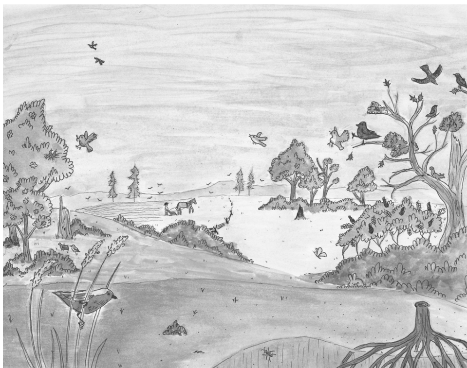
Figure 3. Mural of Rice Lake Plains Tallgrass Communities 1870–1940 by Cheyenne Blacker.