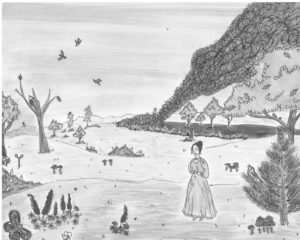
Figure 2. Mural of Rice Lake Plains Tallgrass Communities Pre-1870 by Cheyenne Blacker.