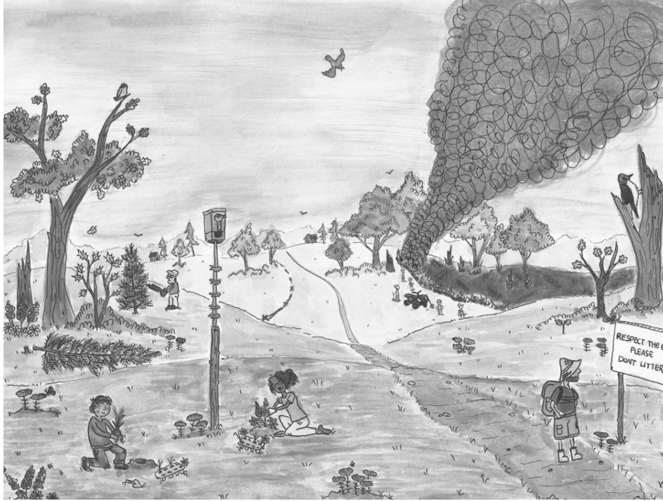
Figure 5. Mural of Rice Lake Plains Tallgrass Communities 1990–Present by Cheyenne Blacker.

tallgrass communities, making it an important area for protection, restoration and long term stewardship.